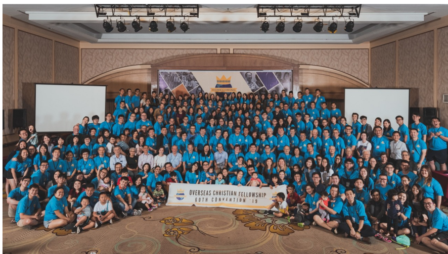
The 60th OCF Australia Convention at Melaka, Malaysia, December 2019.

into the ministry. Each generation built on the work of those who had gone before and handed it on to those who came after. It was a wonderful night of singing, laughter and reminiscing. Many had become firm friends through their service together in OCF.